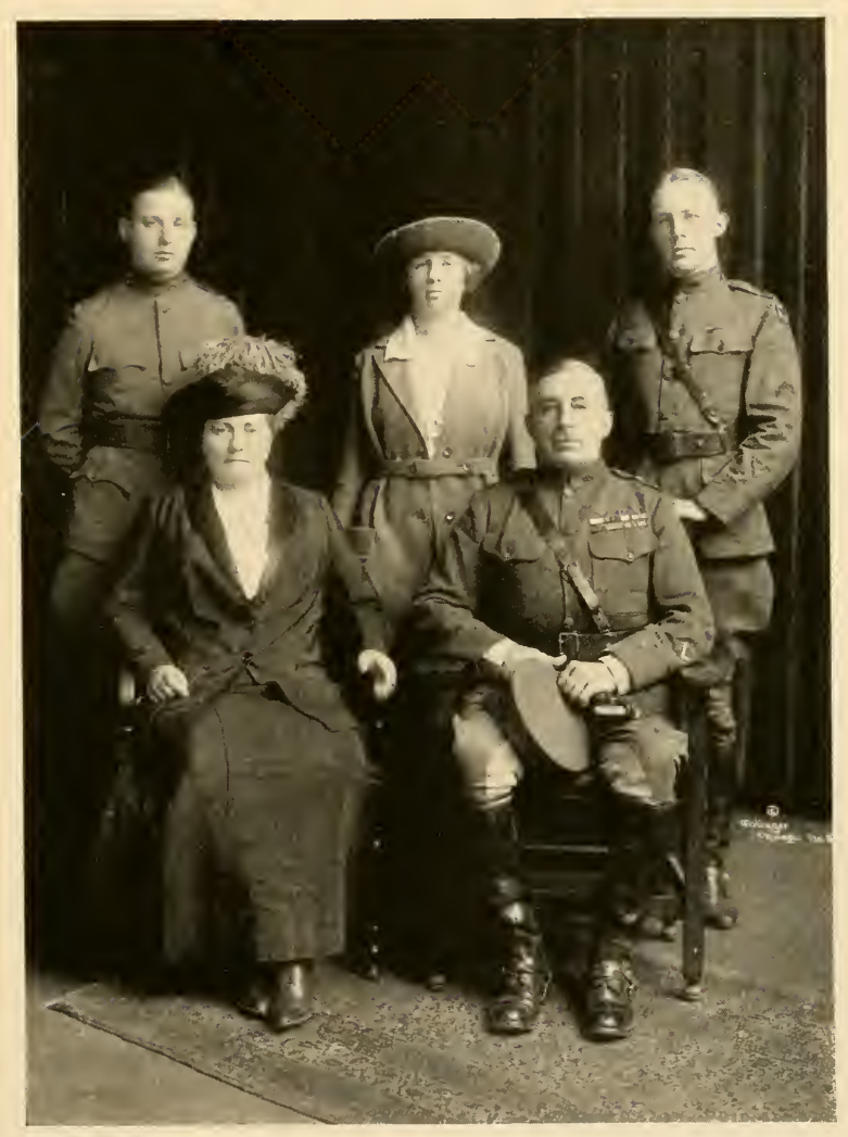
C Wallinger Co.